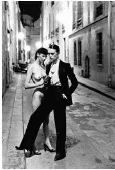
7 Rue Aubriot from the series White Women Paris 1975