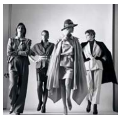
1 Sie kommen from the series Big Nudes Paris 1981