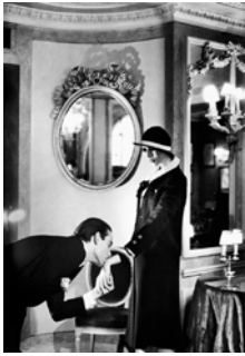
6 At Maxim's from the series Sleepless Nights Paris 1978