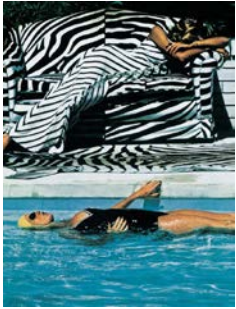
10 French Vogue from the series White Women Melbourne 1973