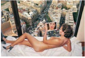
9 Bergstrom over Paris from the series Sleepless Nights 1976