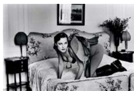
2 Saddle I from the series Sleepless Nights Paris 1976 © Helmut Newton Estate